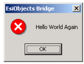
Proxy Assert Message